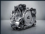
High-quality Aisin BAT transmission featuring excellent energy-saving performance.

In addition to CMA, 2.0TDi engine and Aisin BAT transmission, the Monjaro is also equipped with the latest BorgWarner Intelligent 4x4 System (Sixth Generation).