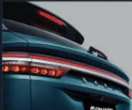
Rear-crossing pulse matrix taillight

Every spot in the taillights sparkles with a cosmic aurora, and countless light spots are connected in an array, releasing infinite energy.