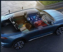
Three Temperature Zone Fully-Automatic Health Air Conditioner