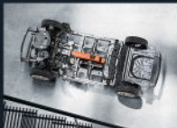
Highly scalable compact module architecture (CMA)