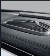
Bose Bespoke Active Noise Cancellation (ANC) Audio

The Monjaro is equipped with eco-friendly suede, which is delicate to the touch, non-toxic and odorless, offering you a high-quality luxury cabin.