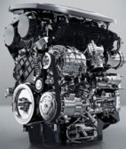
WTCR World Champion-class Drive E 2.0TD Engine