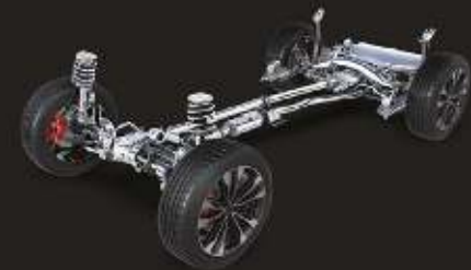
BorgWarner's Fifth-generation 4WD System