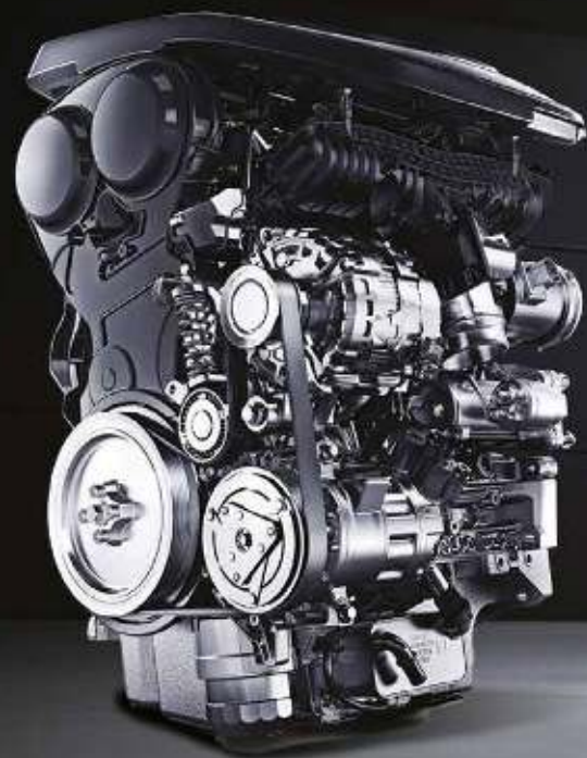
2.0T Four-cylinder Turbo Engine