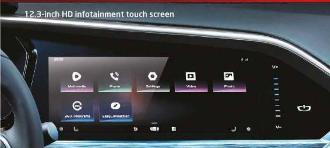
12.3-inch HD infotainment touch screen