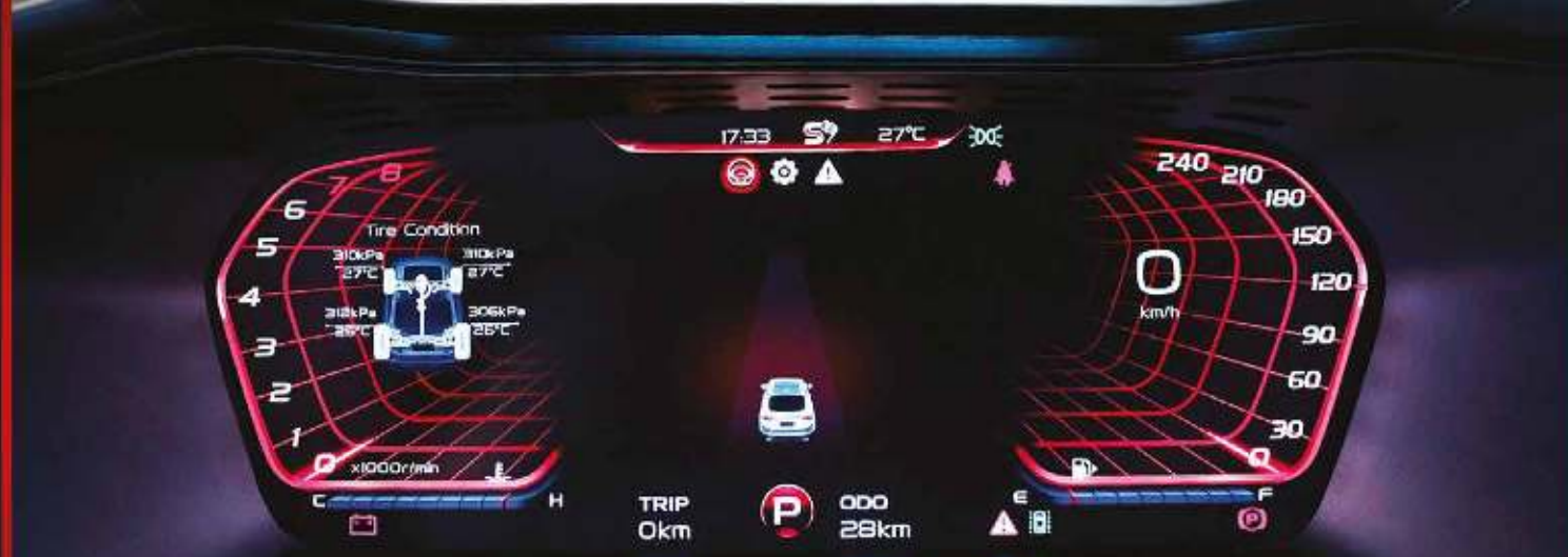
12.3-inch LCD instrument panel