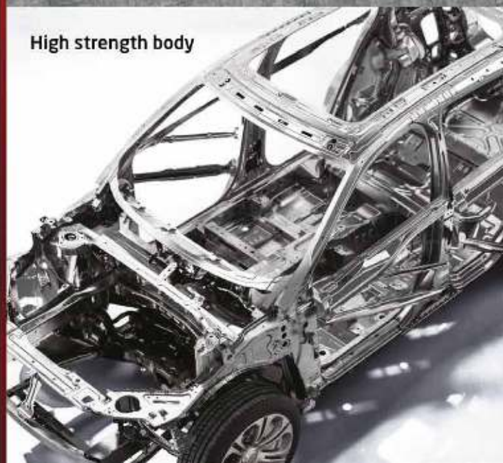
High strength body