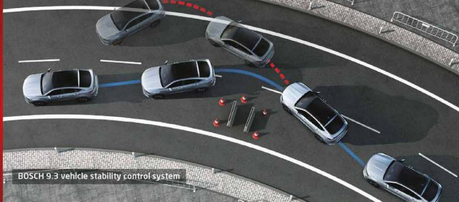
BOSCH 9.3 vehicle stability control system