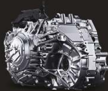
Aisin AW 8AT

This sophisticated combination of powertrain and chassis technology enables the Tugella to accelerate from 0 to 100km/h in just 6.9 seconds for a thrilling driving experience.