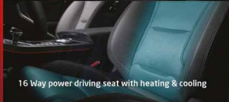
16 Way power driving seat with heating & cooling