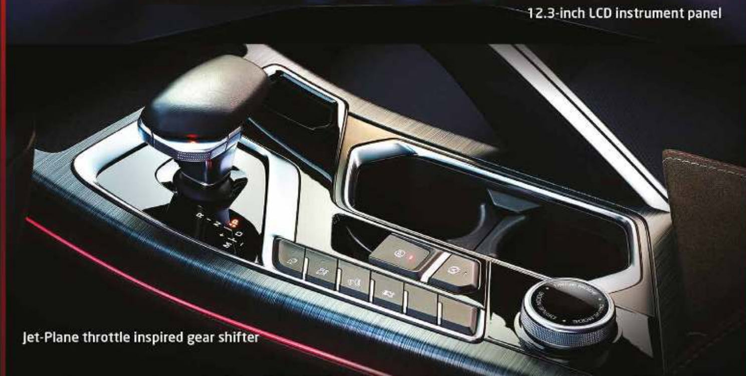
Jet-Plane throttle inspired gear shifter