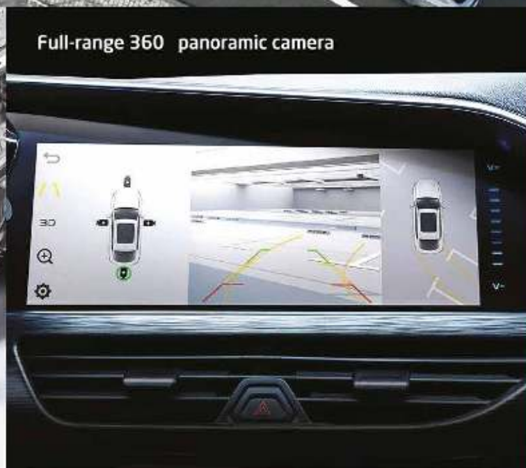
Full-range 360 panoramic camera