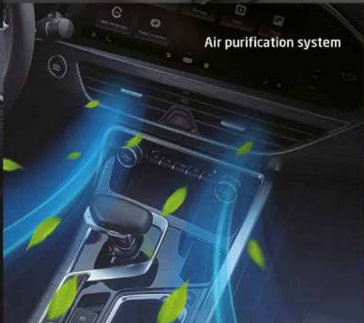
Air purification system