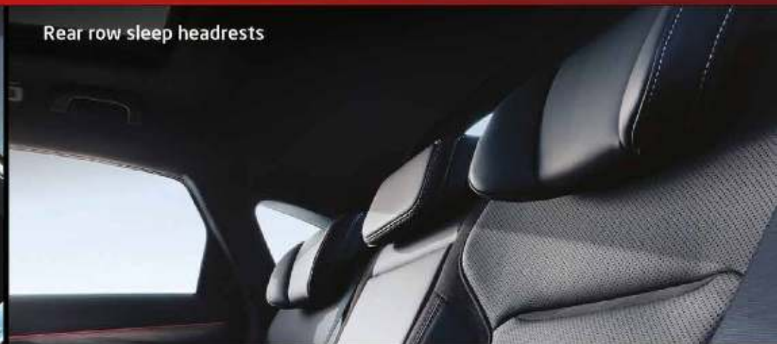
Rear row sleep headrests