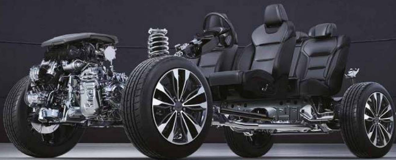
Compact Modular Architecture CMA