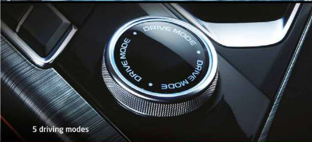
5 driving modes