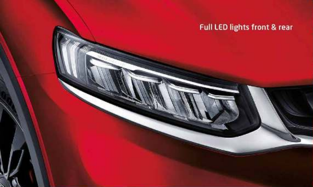
Full LED lights front & rear